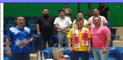
Felicitations of the CEM, KAAC by Principal