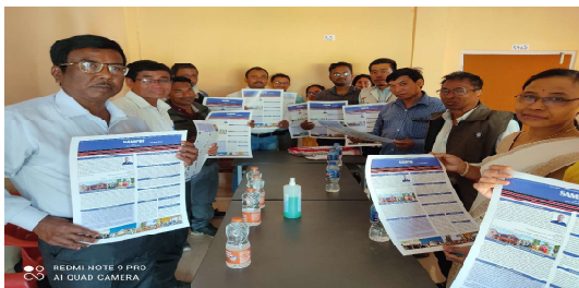
Inauguration of the First Issue of Sampri.