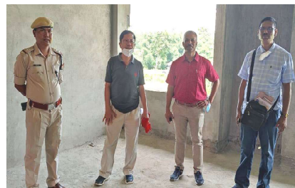
DC, Karbi Anglong visit under construction premises of GMCD