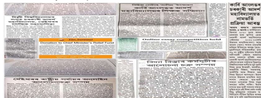
GMCD in Newspapers