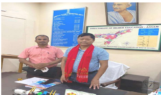
Meeting with Director, Higher Education Department