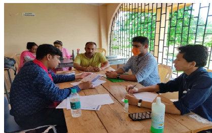
Inspection by Deputy Secretary, AHSEC