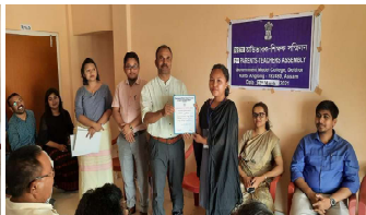
Women's Day Celebrations at GMCD